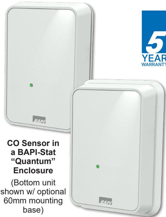
CO Sensor in a BAPI-Stat “Quantum” Enclosure

The green/red LED indicates unit status of normal, alarm, trouble/service or test. The side pushbutton places the unit into test status to verify audible alarm and LED operation. The sensing element has a typical life of 7 years.